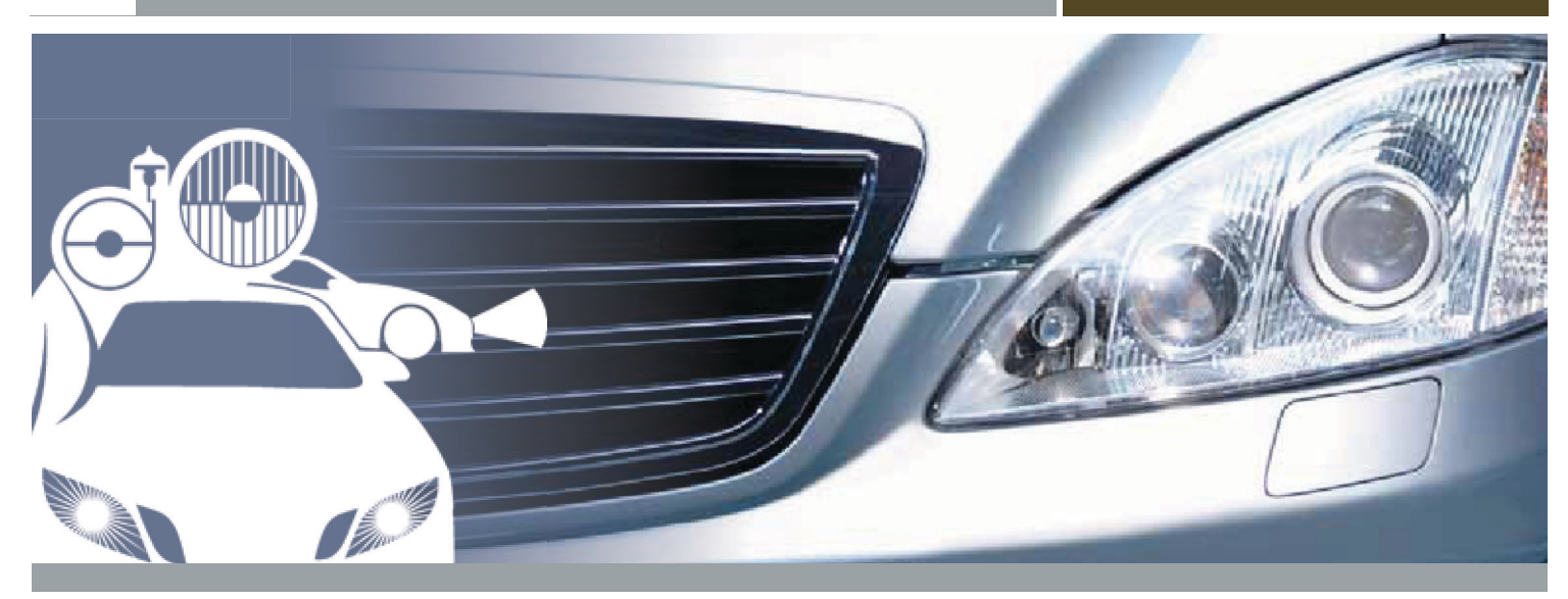
Analog, Mixed Signal and Power Management